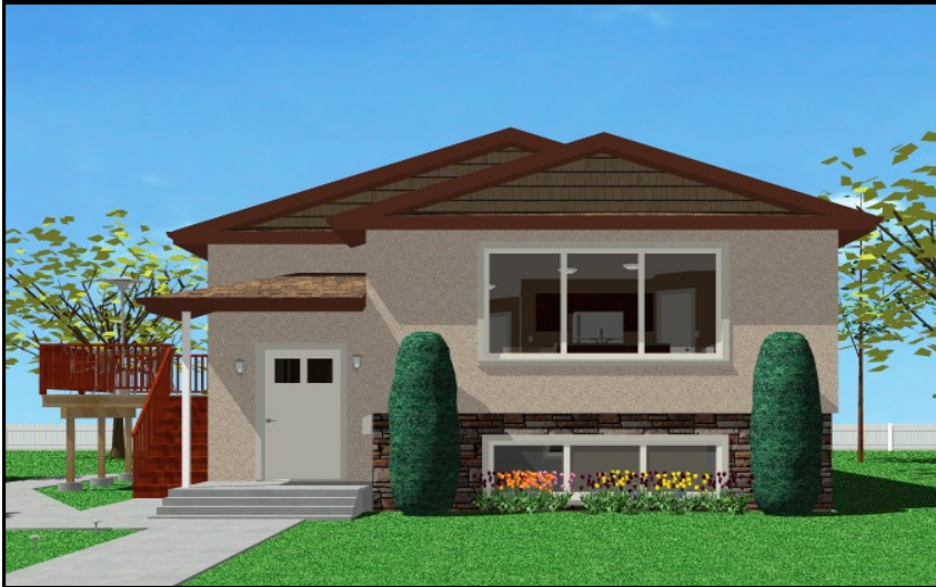
The Wilson - 1344 SF - Bi Level or Bungalow

'B' 12165-154 Street Edmonton, Alberta T5V 1J3 Ph: (780) 702-0600 Fax: (780) 455-7284 Web: www.perfectpanel.ca